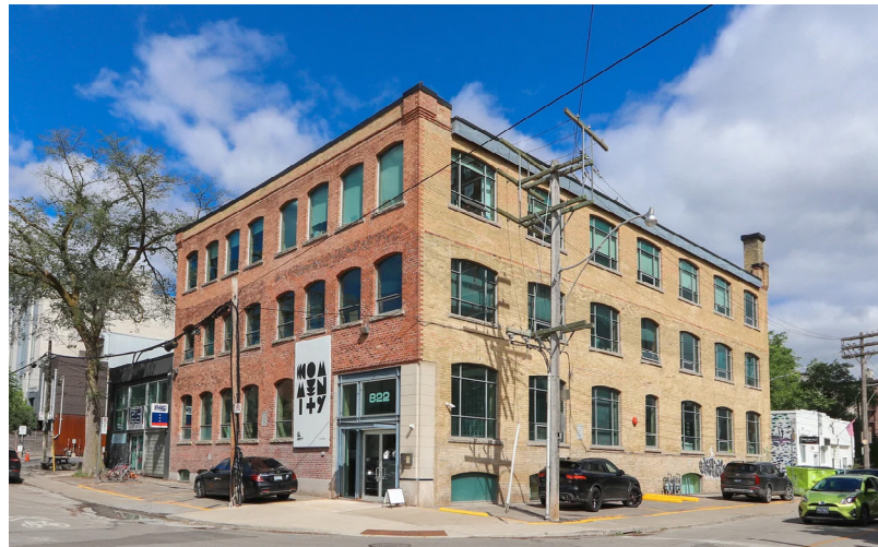
FOR LEASE 822-828 RICHMOND ST. W. 2,410 SF & 3,087 SF