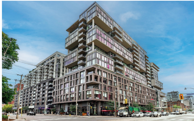
FOR LEASE 111 BATHURST ST. 10,303 SF DIVISIBLE