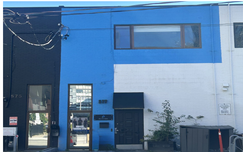
FOR LEASE 577 WELLINGTON ST. W. 3,400 SF