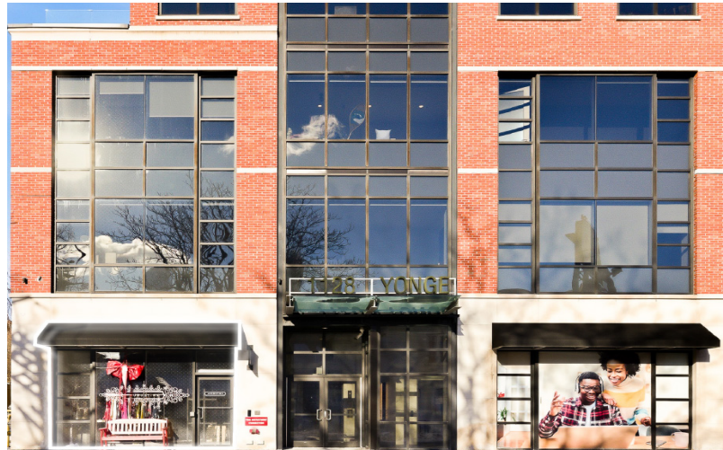
FOR LEASE 1128 YONGE ST. 672 SF