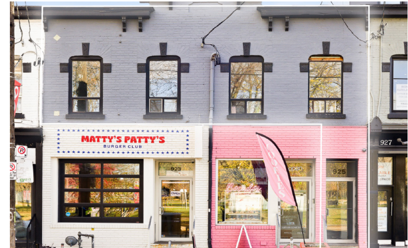
FOR LEASE 925 QUEEN ST. W. 1,591 SF