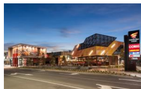
GATEWAY PLAZA SALE PRICE: $35,000,000