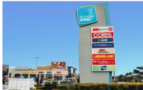
BURWOOD ONE SALE PRICE: 181,000,000