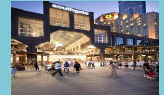
SOUTHGATE SHOPPING CENTRE Landlord: ESR