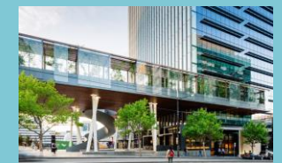
MELBOURNE QUARTER RETAIL Landlord: Lendlease