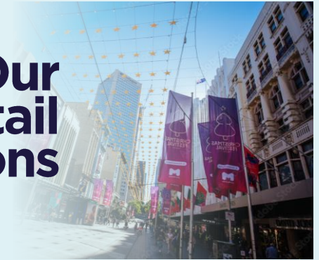
Bourke Street Mall, Melbourne