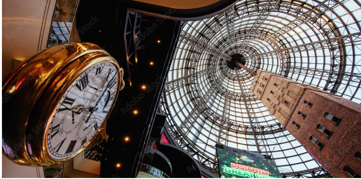
Melbourne Central Plaza, Melbourne