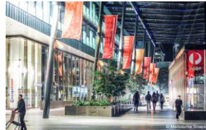
SOUTHERN CROSS 1 & 2 SALE PRICE: $675,000,000