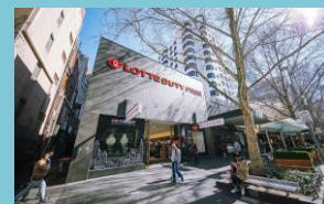
185 SWANSTON STREET, MELBOURNE Landlord: Private