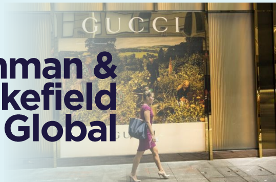
Gucci, Collins Street, Melbourne