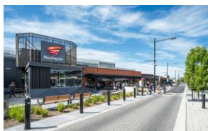
NORTHGATE SHOPPING CENTRE SALE PRICE: $71,000,000