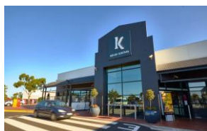
KEILOR PLAZA S.C. SALE PRICE: $67,000,000