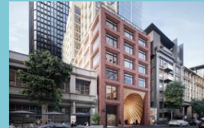
51 FLINDERS LANE, MELBOURNE Landlord: GPT