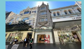
280-282 BOURKE STREET, MELBOURNE Landlord: Private