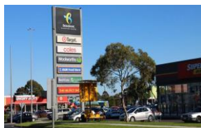
BRIMBANK SHOPPING CENTRE SALE PRICE: $153,000,000