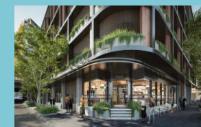
7 SIDDELEY STREET, DOCKLANDS Landlord: Mirvac