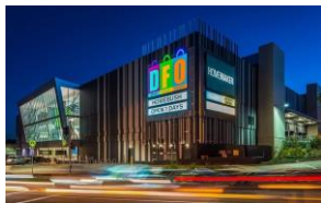
DFO PORTFOLIO, VIC & NSW SALE PRICE: $550,000,000