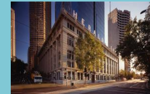
8 EXHIBITION STREET, MELBOURNE Landlord: GPT / Keppel