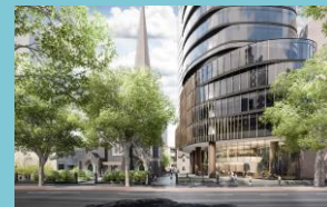
WESLEY CHURCH, MELBOURNE Landlord: Charter Hall