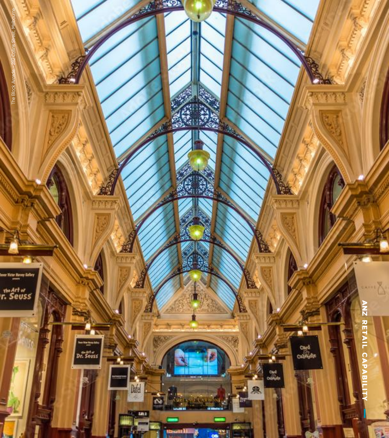
The Block Arcade - 282 Collins Street, Melbourne