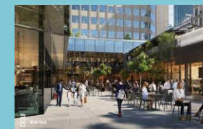
500 BOURKE STREET, MELBOURNE Landlord: ISPT