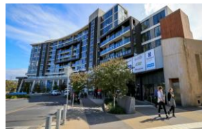
STOCKLAND, TOORONGA SALE PRICE: $62,500,000