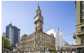
MELBOURNE GPO SALE PRICE: $86.940,000