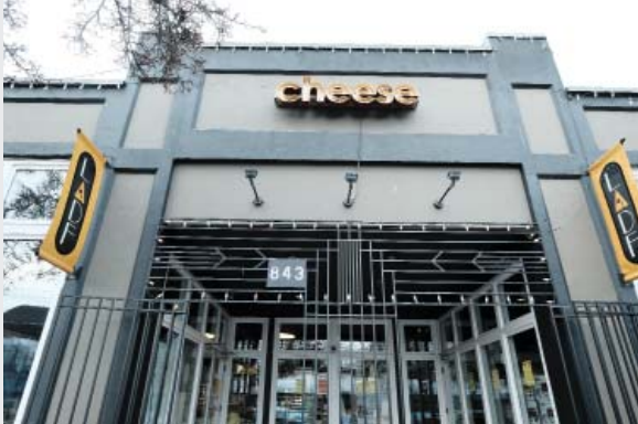
Les Amis du Fromage