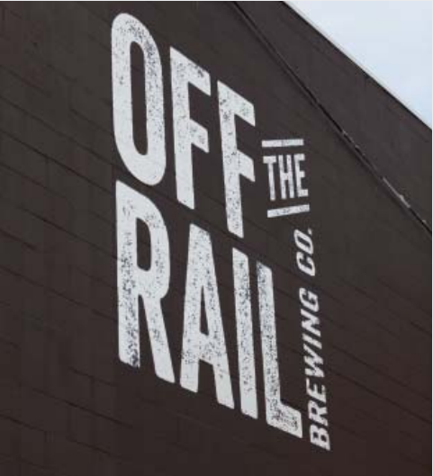
Off The Rail Brewing