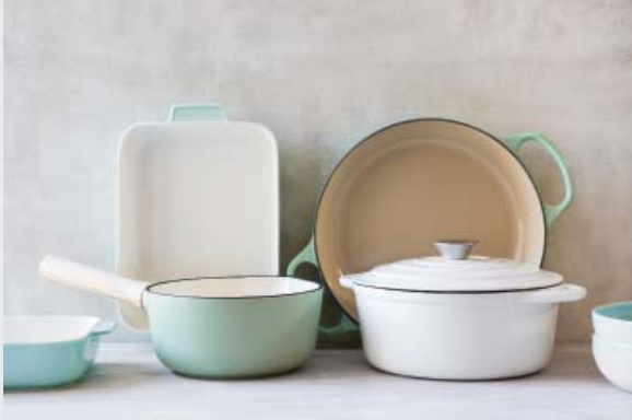
The Gourmet Warehouse