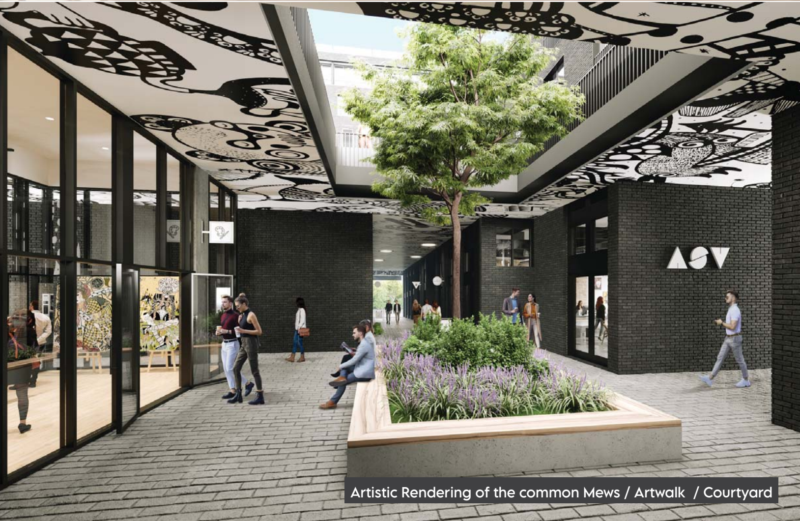
Artistic Rendering of the common Mews / Artwalk / Courtyard