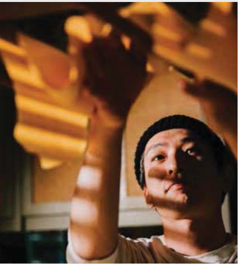
Caffe La Tana