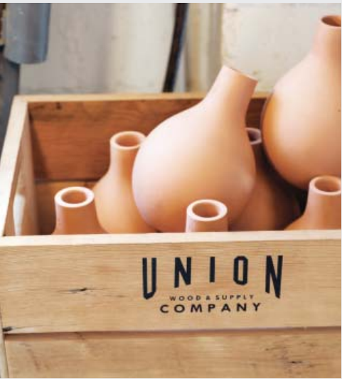
Union Wood Co