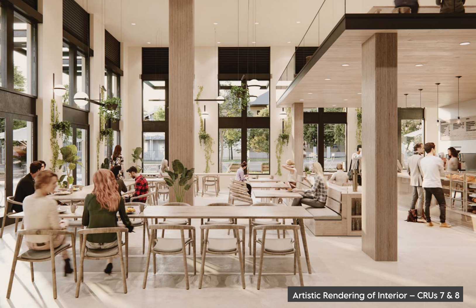
Artistic Rendering of Interior – CRUs 7 & 8