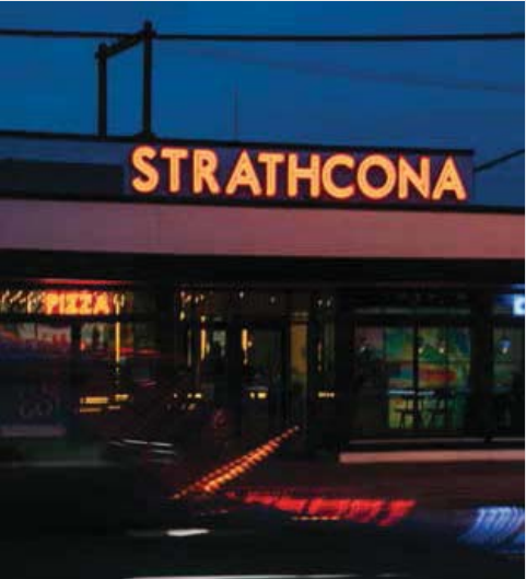
Strathcona Beer Company