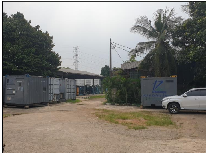
Open Space Area