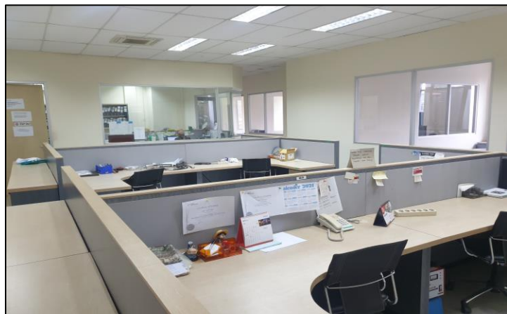
Inside Office Building