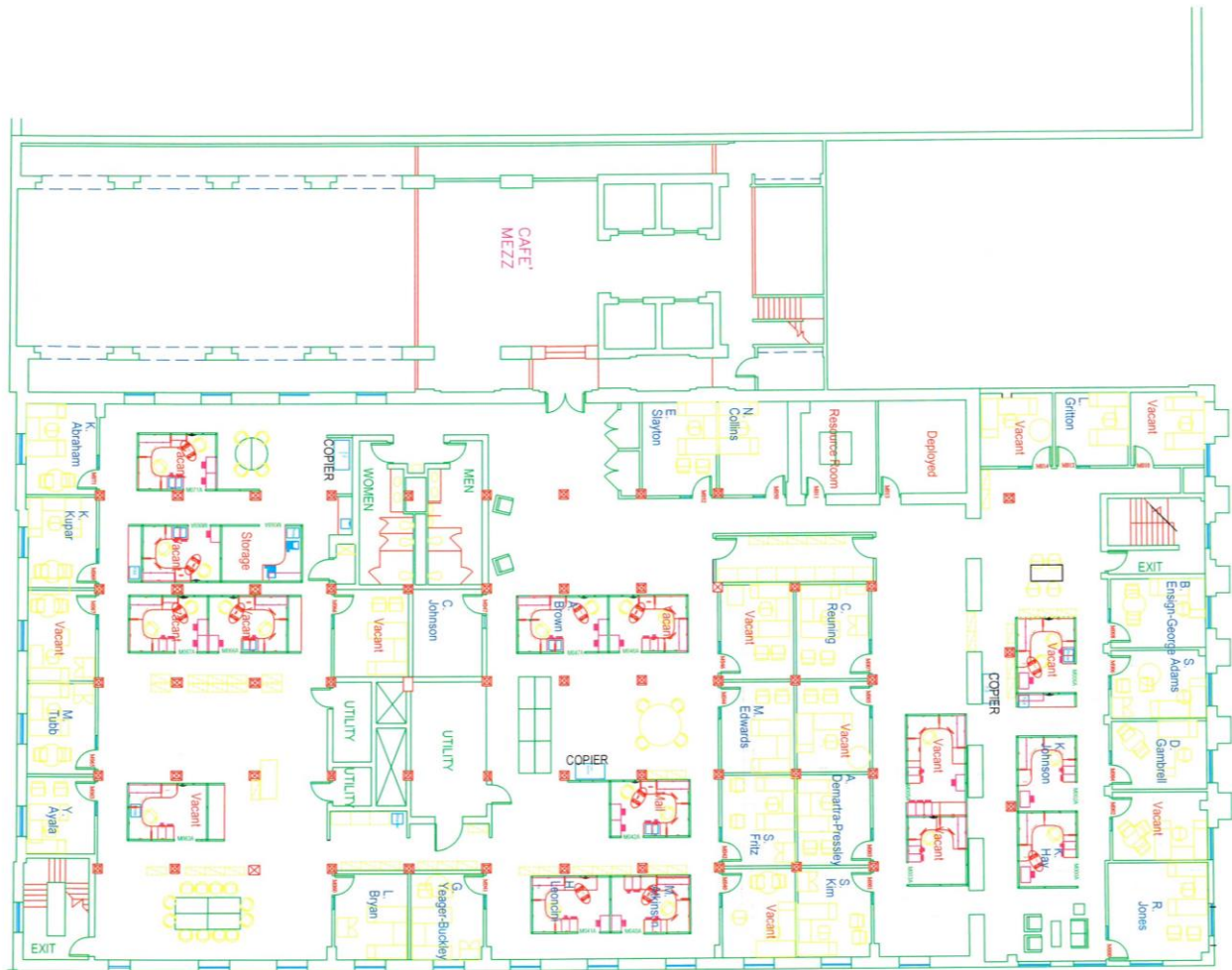
Mezzanine Floor East (B) December, 2022