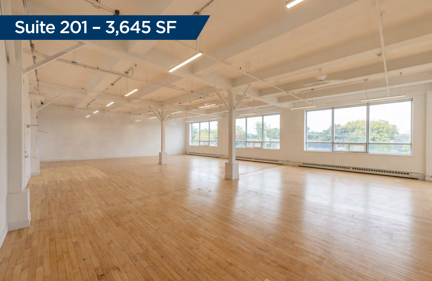
Suite 201 - 3,645 SF