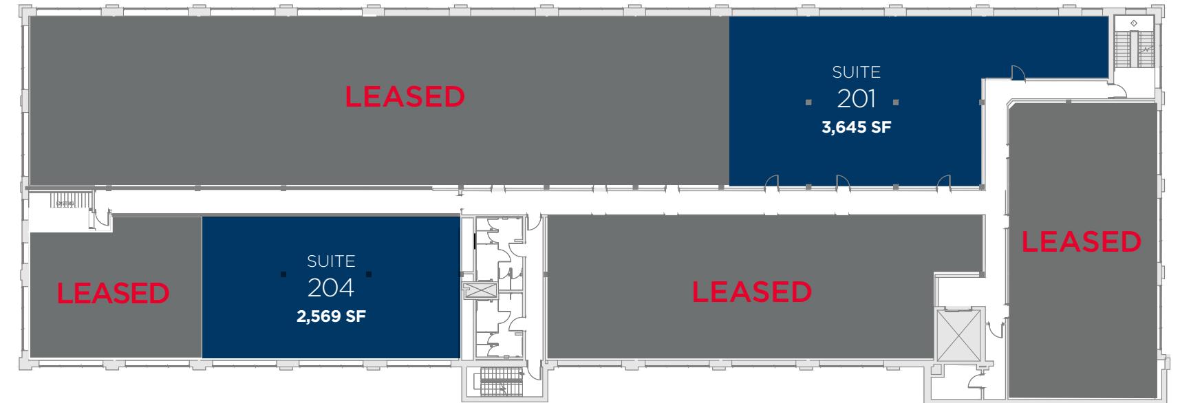
Second Floor UP TO 14' CEILING HEIGHT