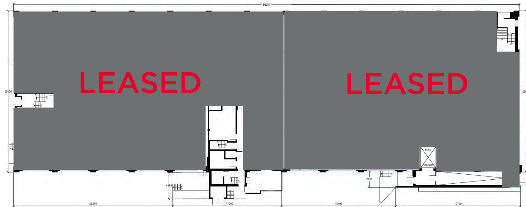
Ground Floor LEASED