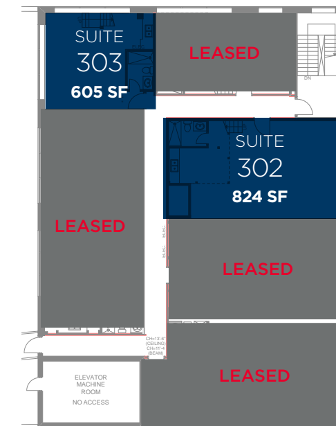
Third Floor UP TO 14' CEILING HEIGHT