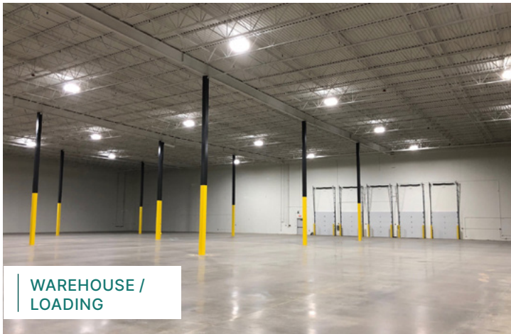
WAREHOUSE / LOADING