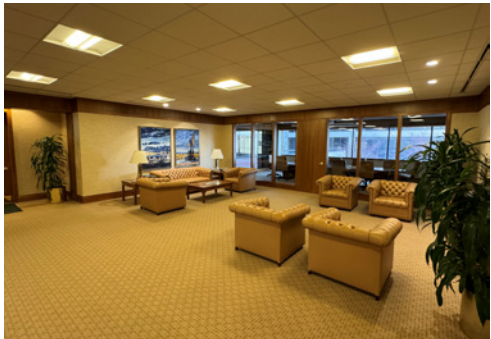
SHARED BUILDING LOBBY