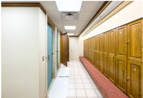
LOCKER ROOMS WITH SHOWERS