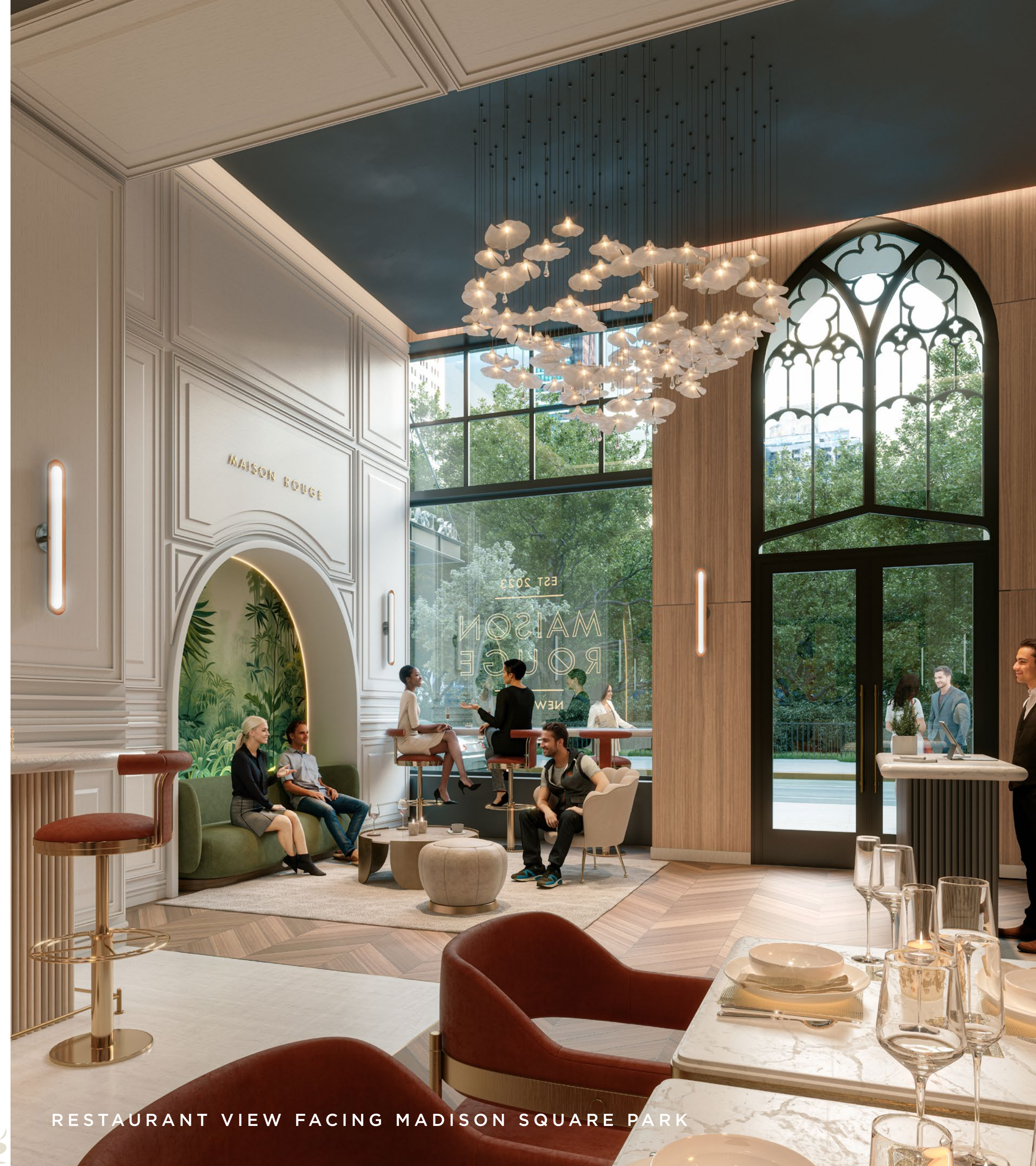
RESTAURANT VIEW FACING MADISON SQUARE PARK