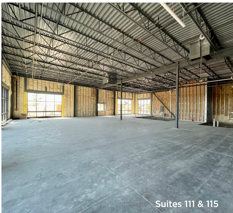
Suites 111 & 115