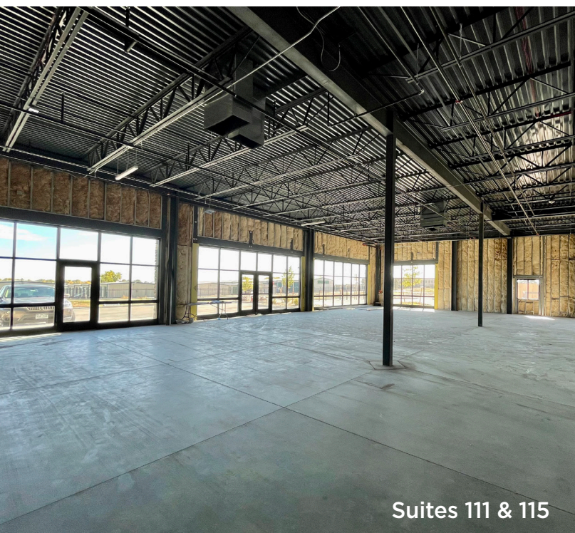
Suites 111 & 115