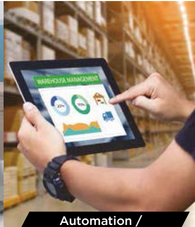
Automation / Advance Solution