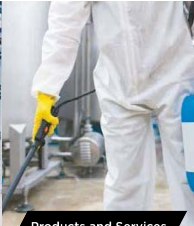
Products and Services