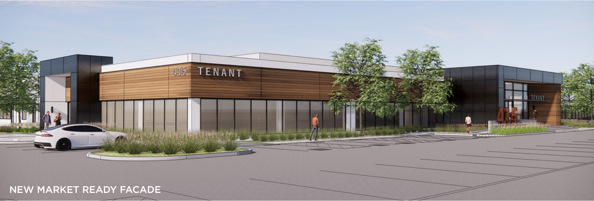
NEW MARKET READY FACADE