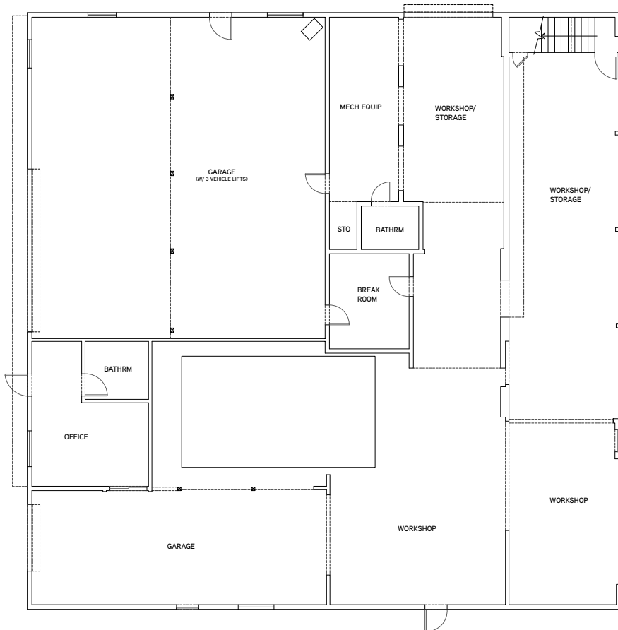
6,472 SF FIRST FLOOR