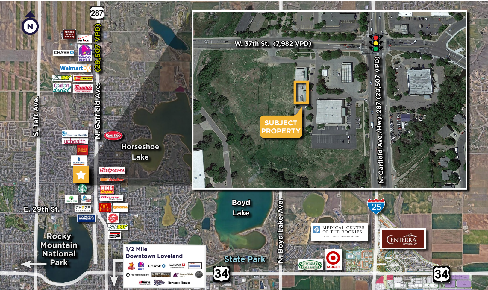
For reference only - not current layout