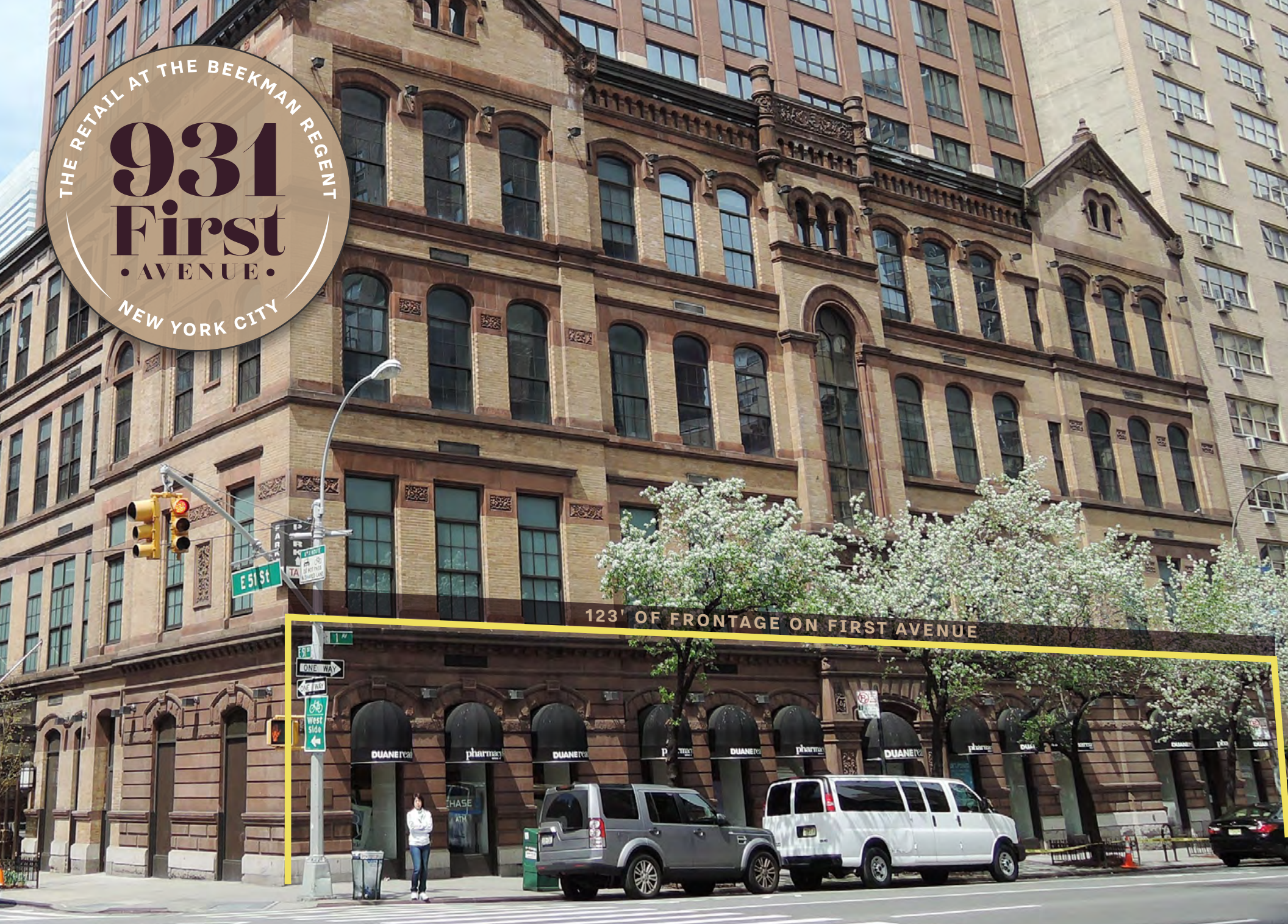
NORTHWEST CORNER OF EAST 51ST STREET