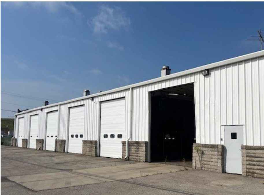
EXTERIOR MAINTENANCE BAY DOORS