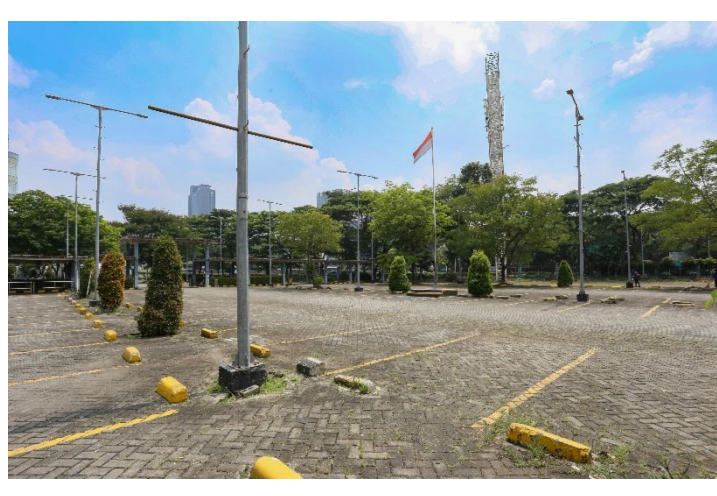
Cushman & Wakefield copyright 2024. No warranty or representation, express or implied, is made to the accuracy or completeness of the information contained herein, and same is submitted subject to errors, omissions, change of price, rental or other conditions, withdrawal without notice, and to any special listing conditions imposed by the property owner(s). As applicable, we make no representation as to the condition of the property (or properties) in question.