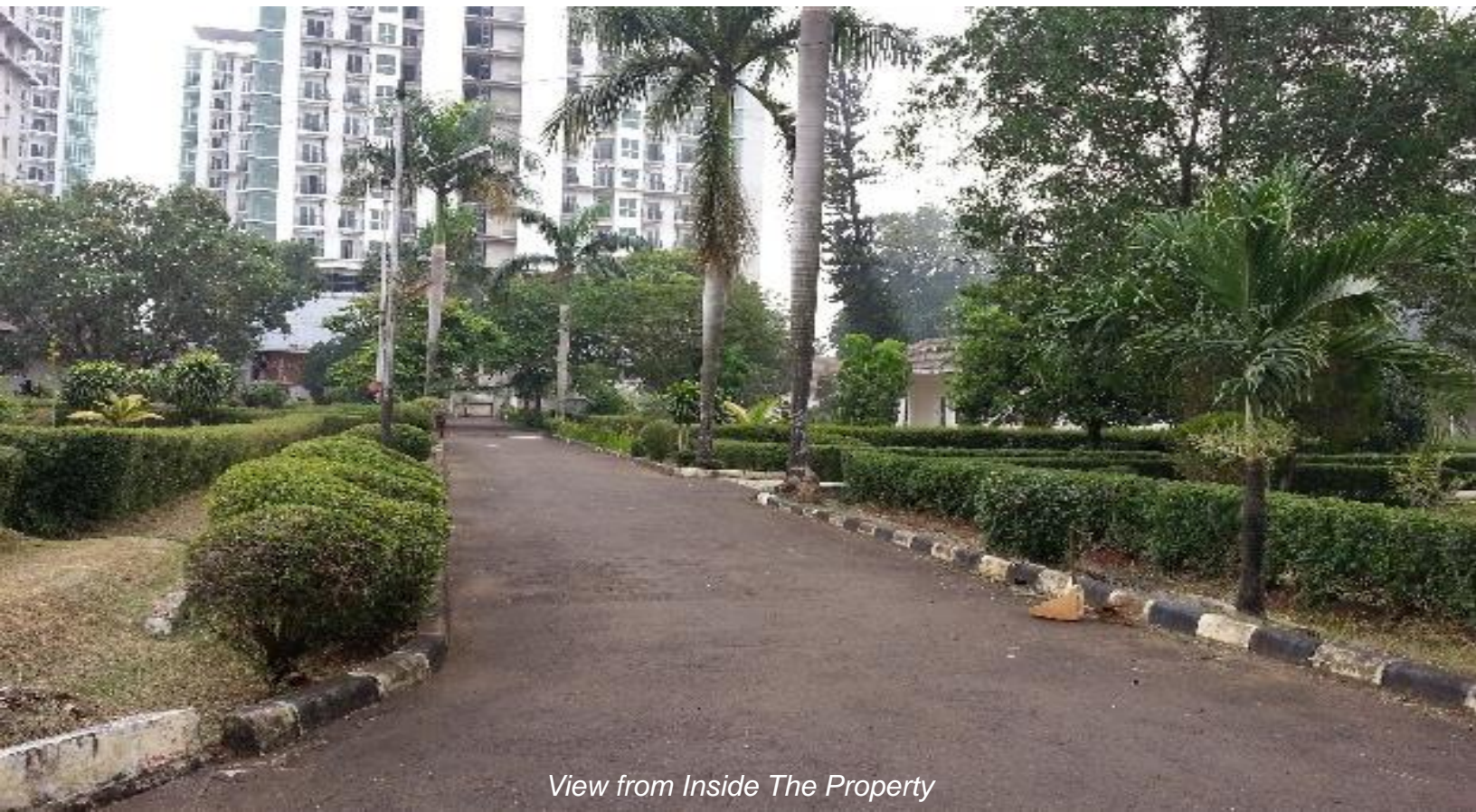
View from Inside The Property