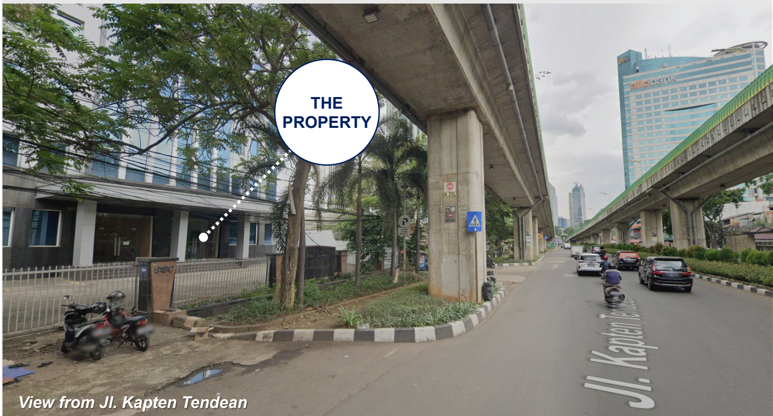
View from Jl. Kapten Tendean

Disclaimer: © 2024 Cushman & Wakefield. All rights reserved. This document is made available for information purposes only by Cushman & Wakefield, who does not make any warranties or representations in relation to the property (or properties). The information in this document has been provided by our vendor(s) or has been obtained from sources believed to be reliable but has not been verified. We therefore cannot guarantee the reliability, currency, accuracy or completeness of the information contained herein, and as such, Cushman & Wakefield makes no statement, representation or warranty, and assumes no legal liability in relation to the reliability, currency, accuracy or completeness of the information provided. Interested parties should conduct their own due diligence in relation to each property they are considering purchasing.