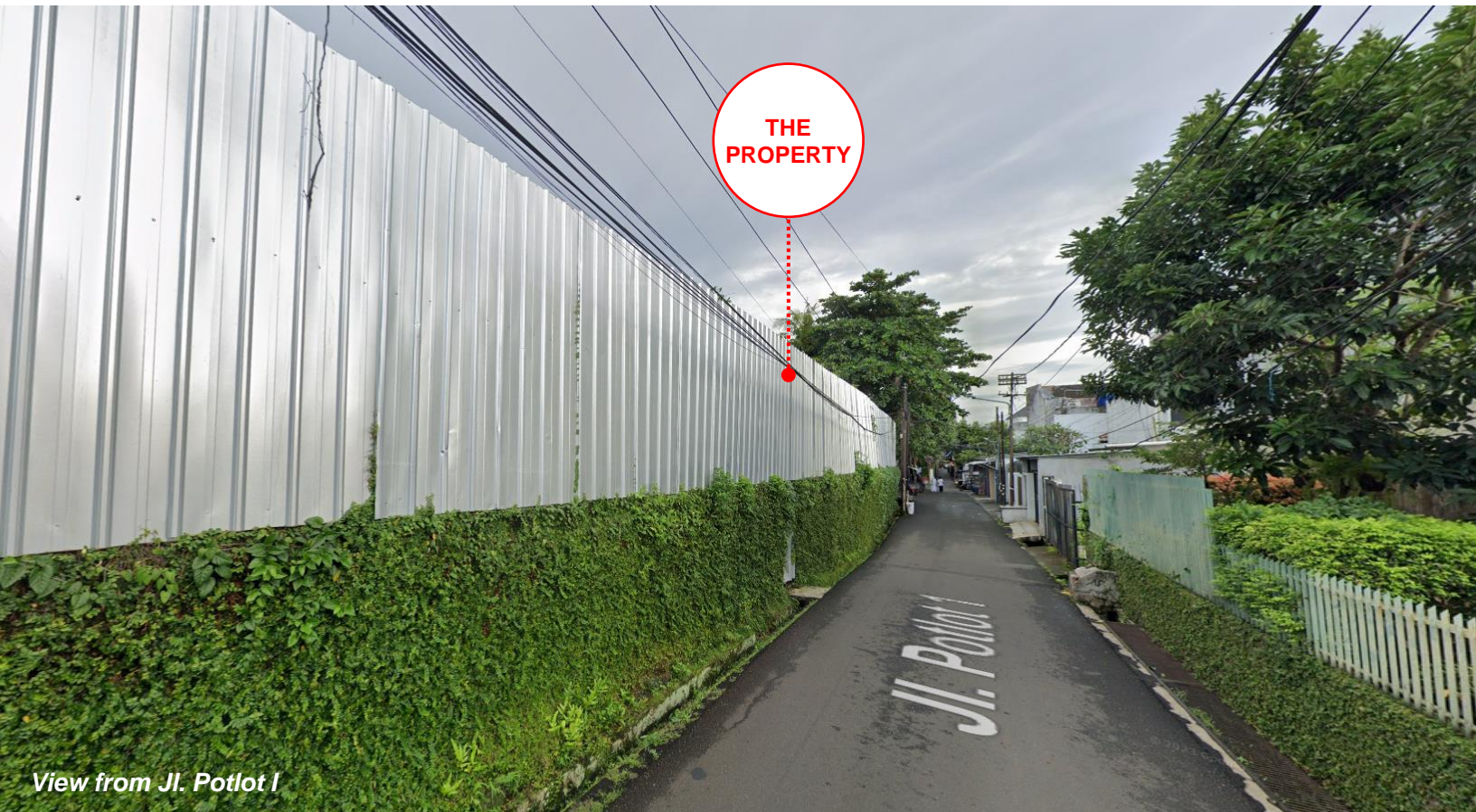
View from Jl. Potlot I