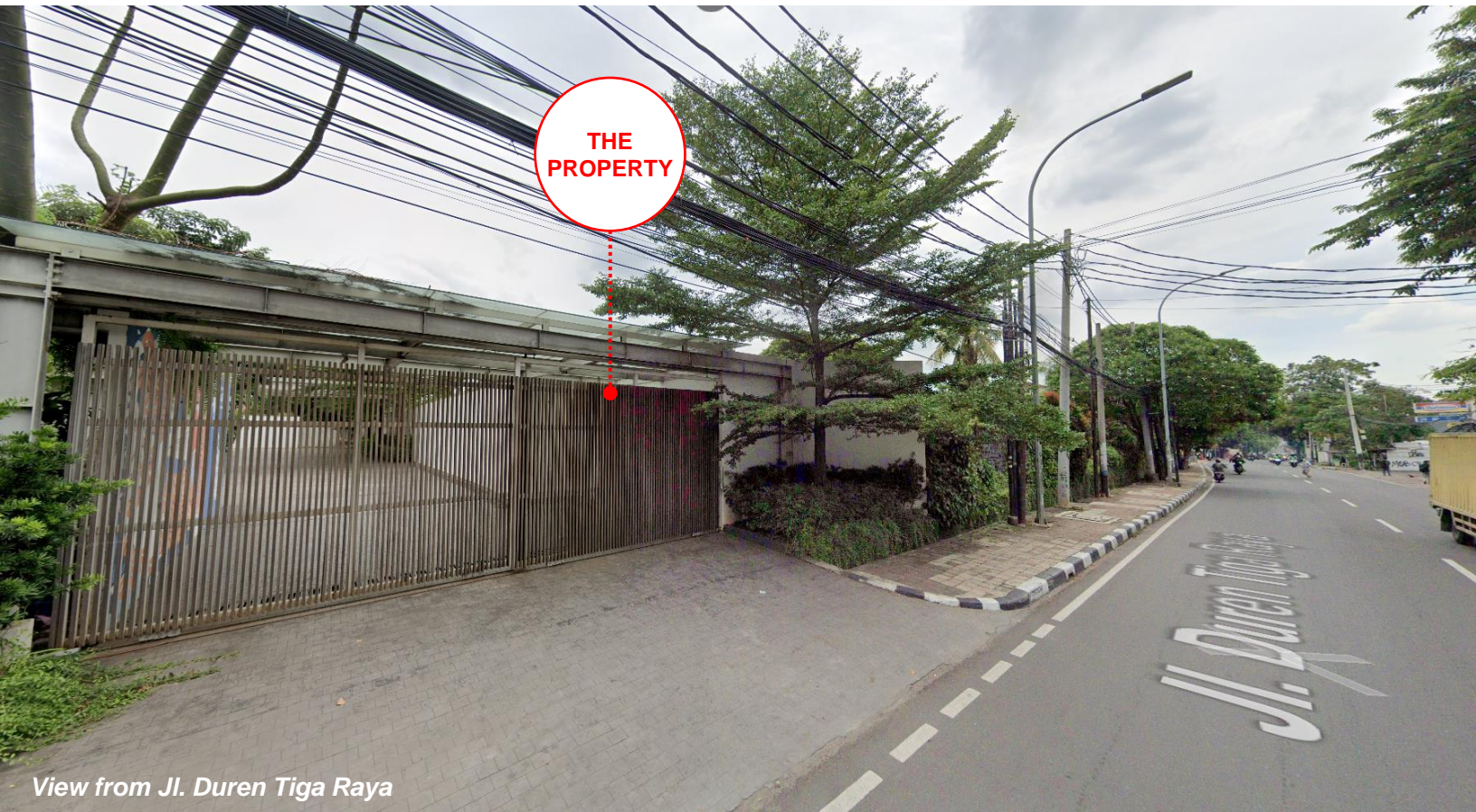
View from Jl. Duren Tiga Raya