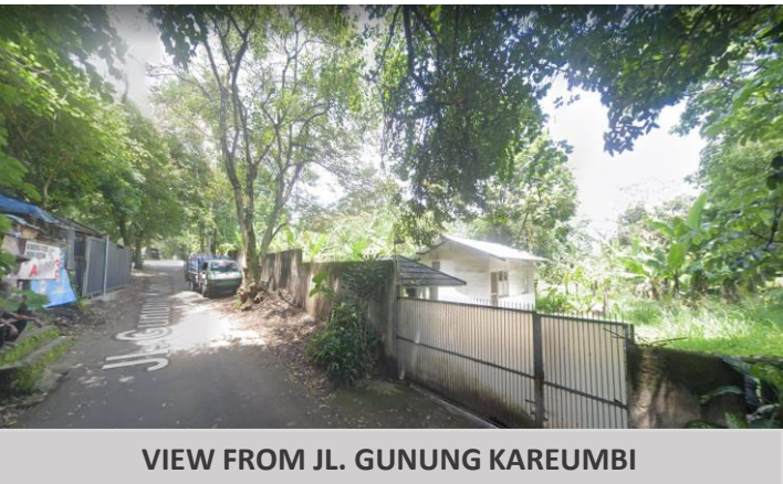
VIEW FROM JL. GUNUNG KAREUMBI