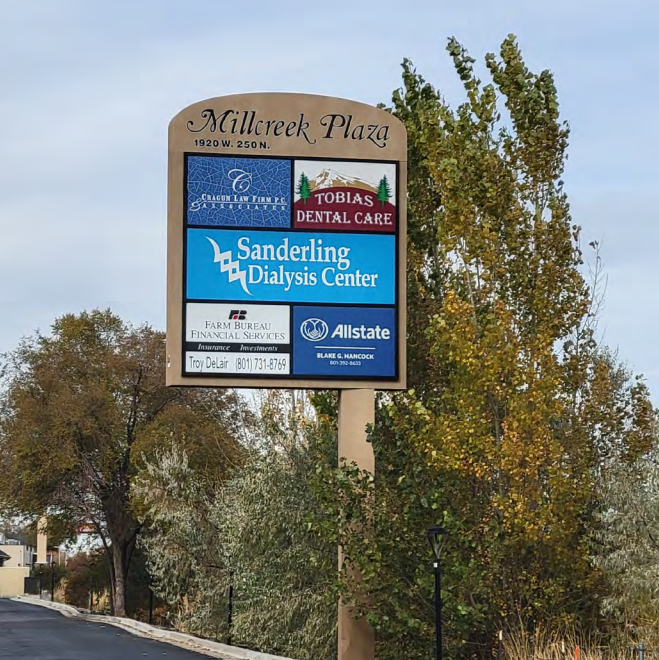
PYLON SIGNAGE WITH I-15 VISIBILITY