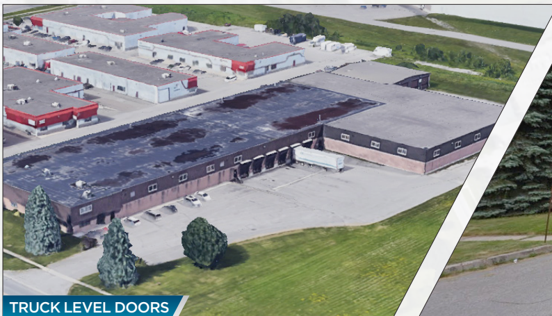
TRUCK LEVEL DOORS