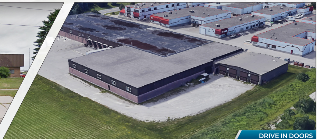
DRIVE IN DOORS