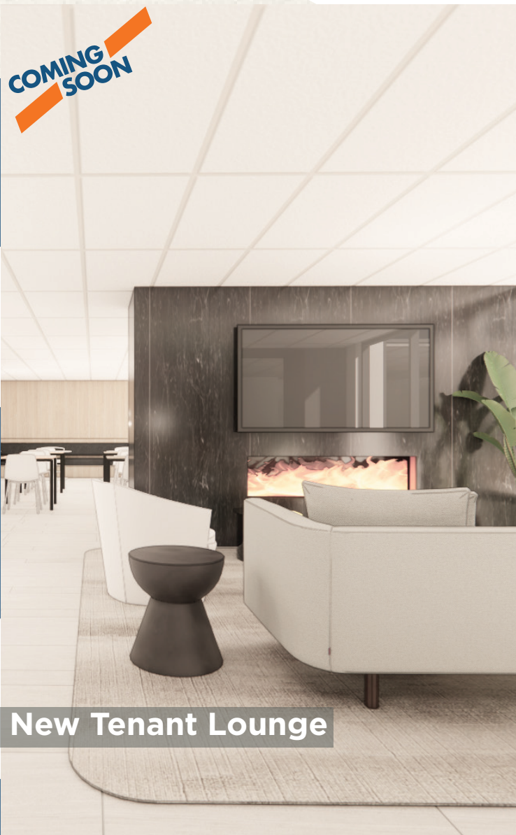
New Tenant Lounge