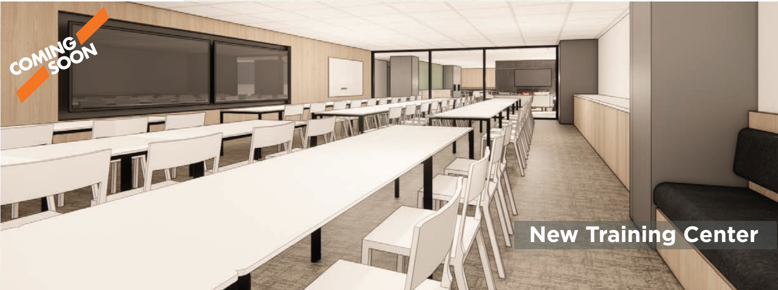
New Training Center