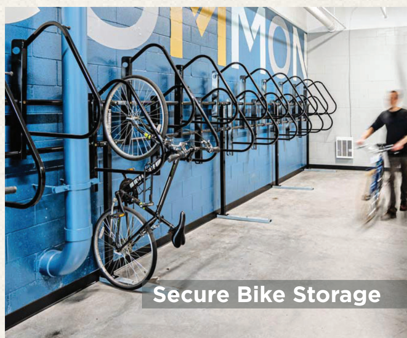
Secure Bike Storage