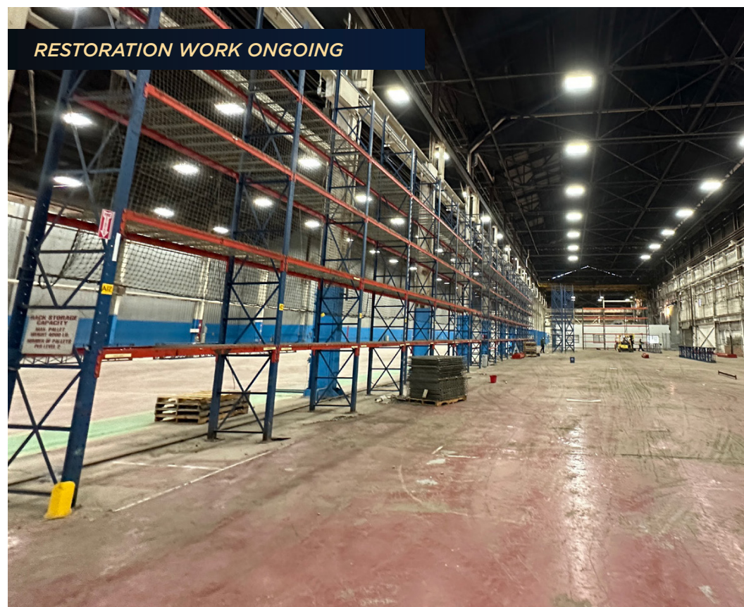
RESTORATION WORK ONGOING