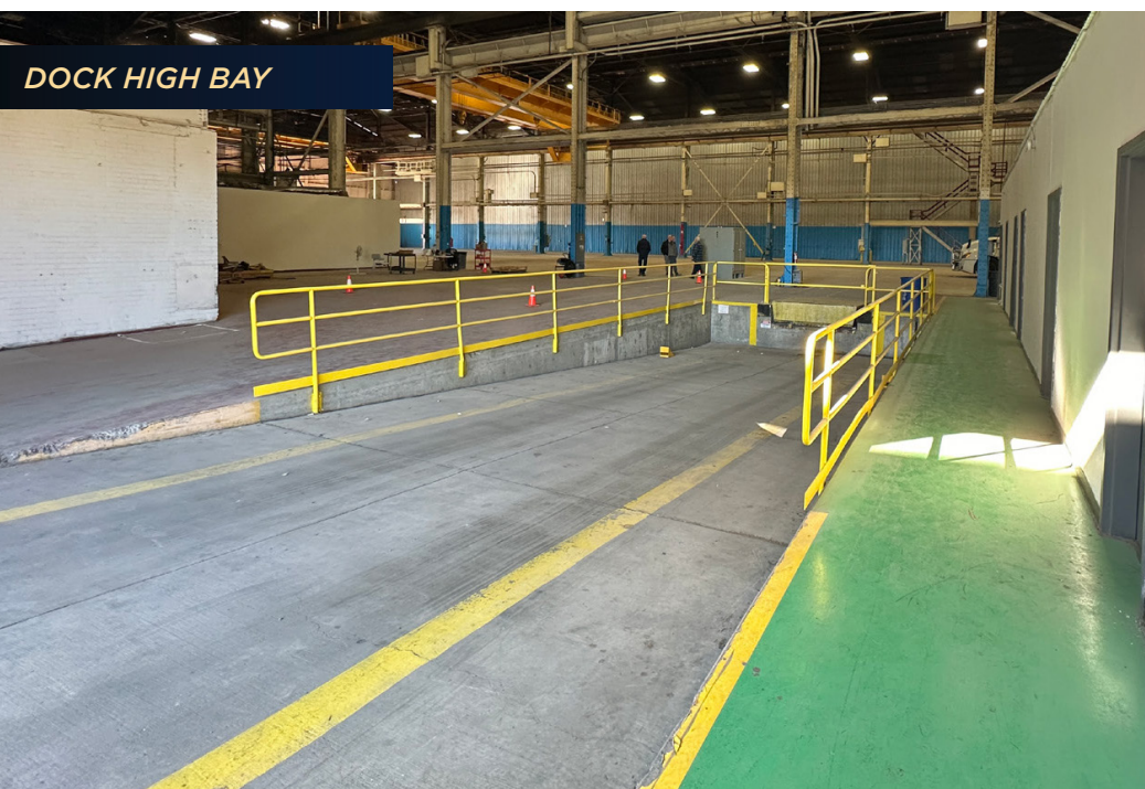
DOCK HIGH BAY