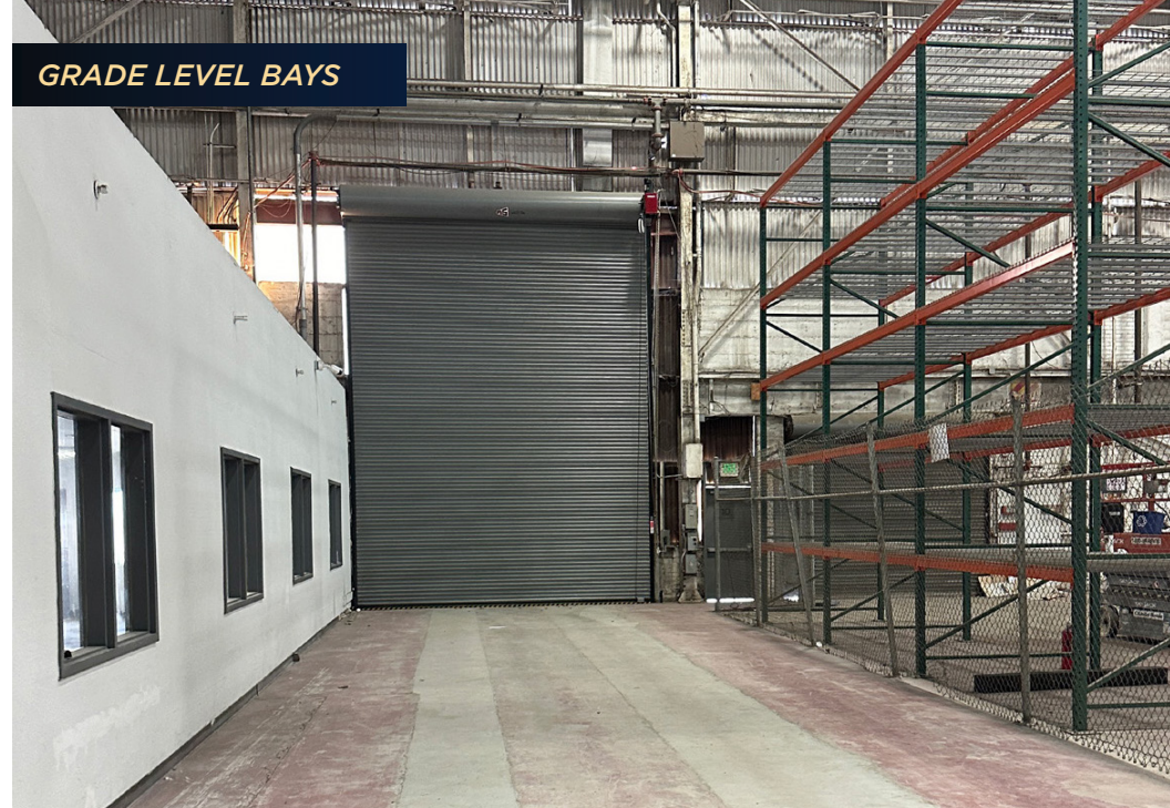
GRADE LEVEL BAYS