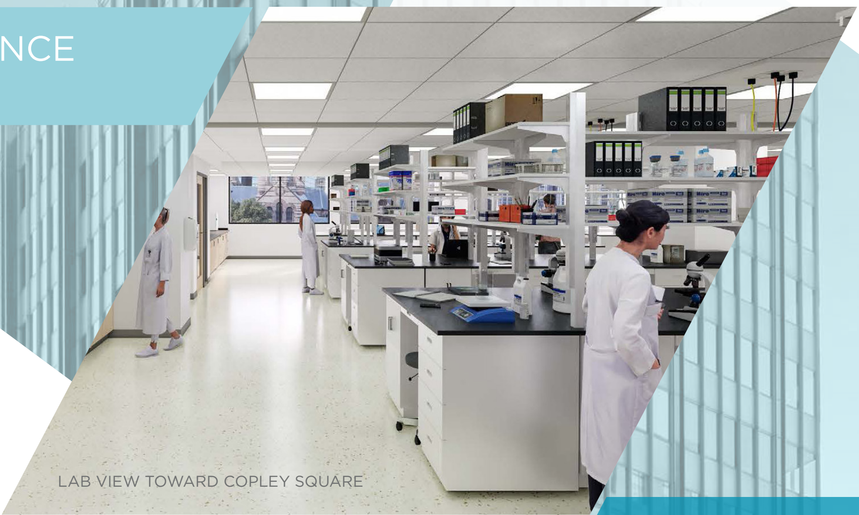
LAB VIEW TOWARD COPLEY SQUARE

YOU BRING THE SCIENCE, THE REST IS HERE.