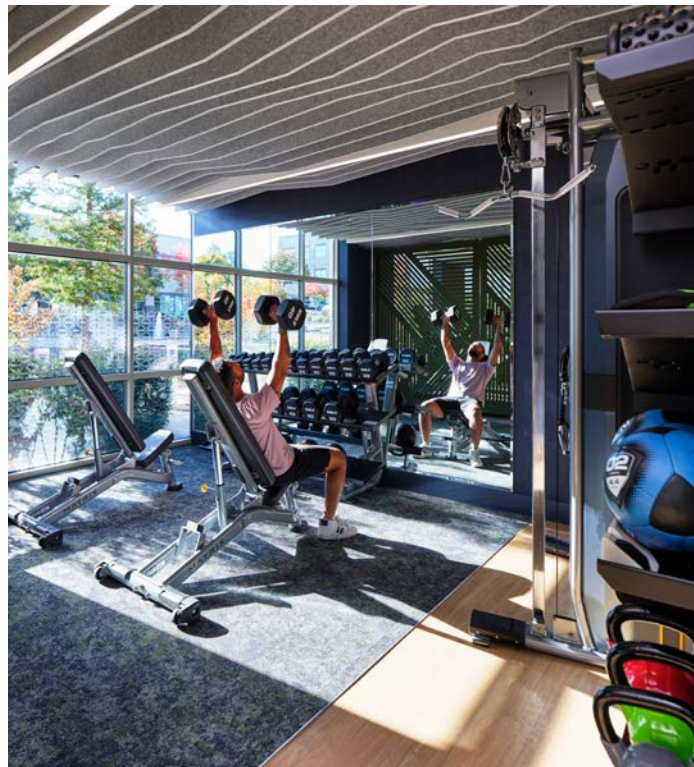
DEDICATED WEIGHTS/STRENGTH AREA