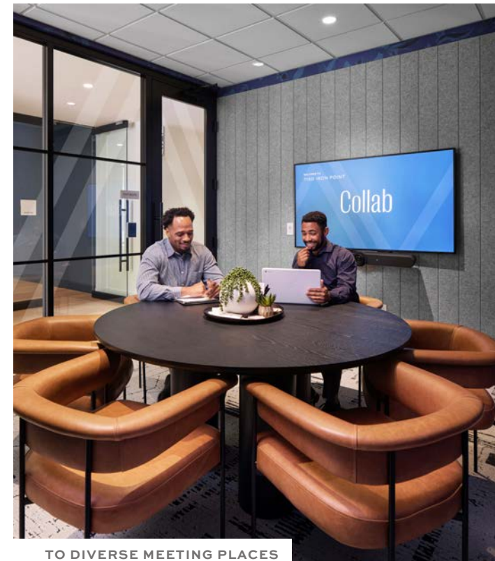
TO DIVERSE MEETING PLACES