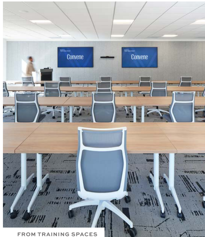
FROM TRAINING SPACES