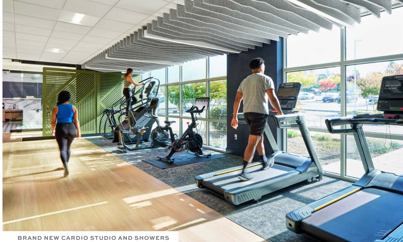
BRAND NEW CARDIO STUDIO AND SHOWERS

It's a place where employees can exercise, relax, and rejuvenate amidst nature's beauty.