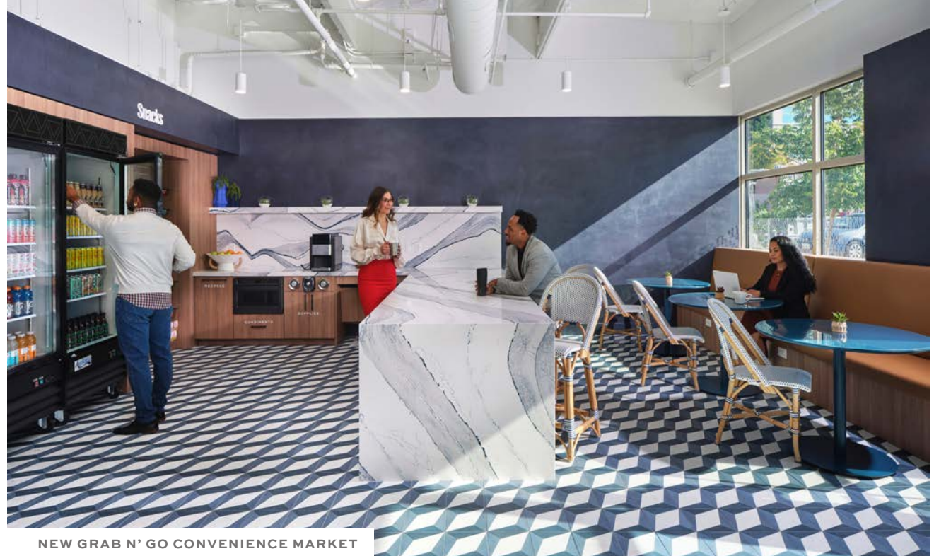
NEW GRAB N' GO CONVENIENCE MARKET

Our modern campus offers businesses of all sizes the opportunity to work in an amenity-rich environment surrounded by nature trails, dining, shopping, and entertainment.