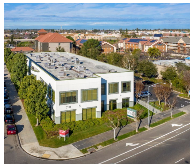
MONUMENT SIGN & BLDG