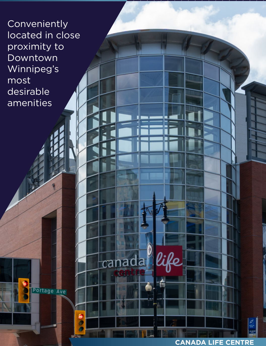
CANADA LIFE CENTRE

Conveniently located in close proximity to Downtown Winnipeg's most desirable amenities