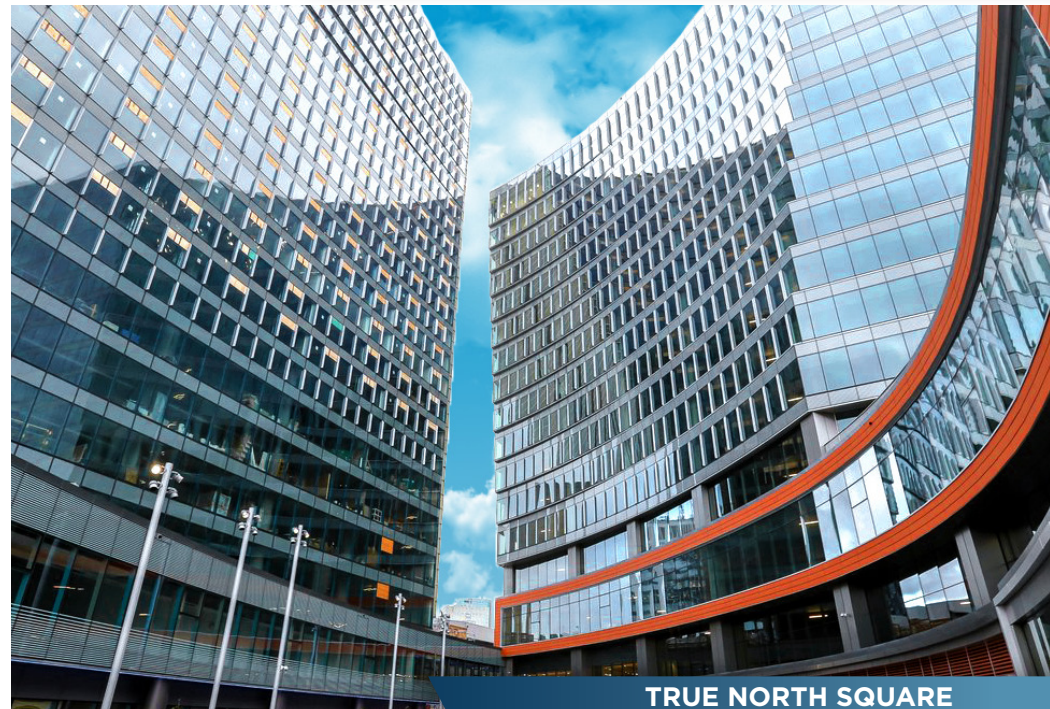
TRUE NORTH SQUARE