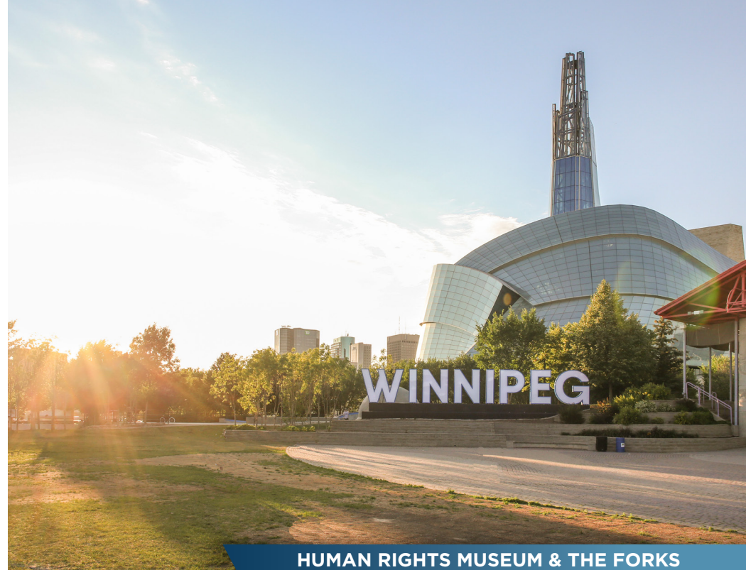
HUMAN RIGHTS MUSEUM & THE FORKS