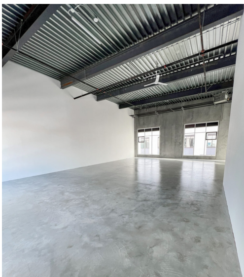
UNIT 104 2ND FLOOR