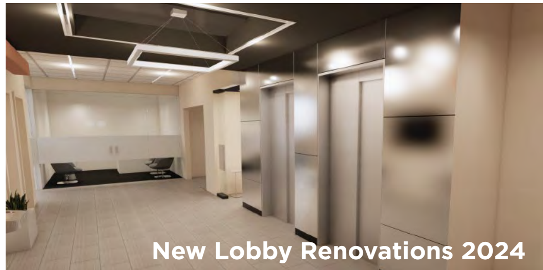
New Lobby Renovations 2024