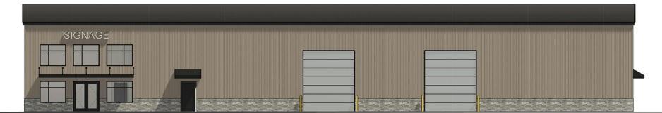
BUILDING 3 | REAR ELEVATION