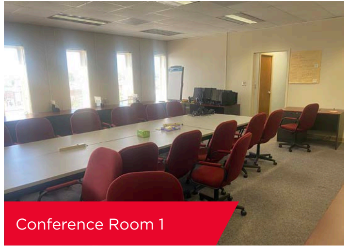
Conference Room 1