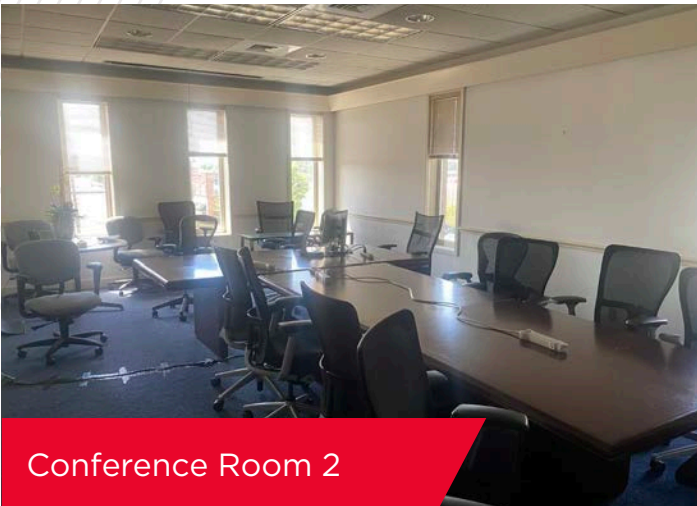
Conference Room 2