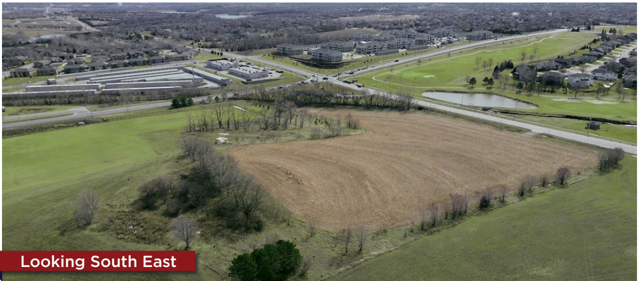
Looking South East