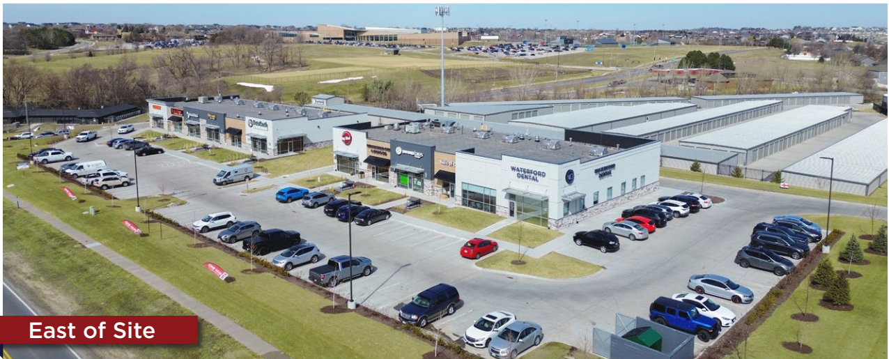
East of Site