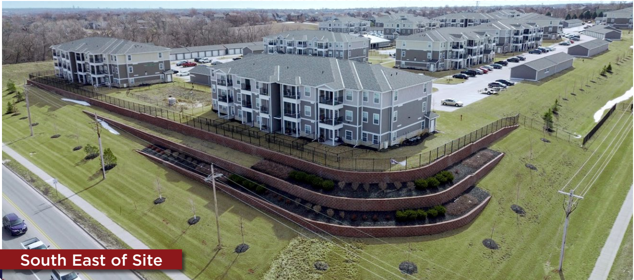
South East of Site