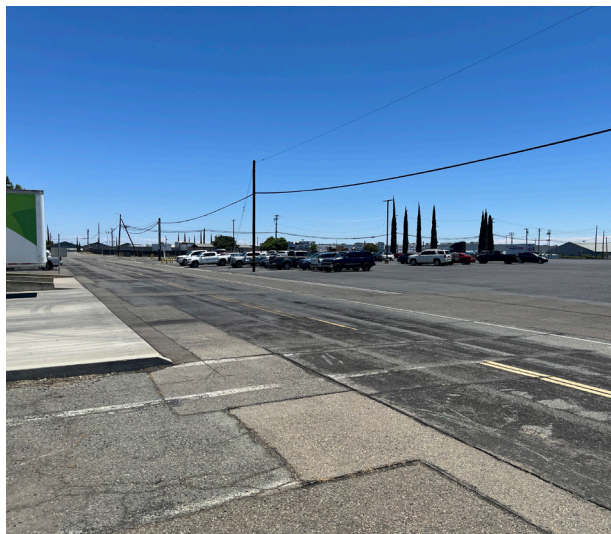
ADJACENT EMPLOYEE PARKING