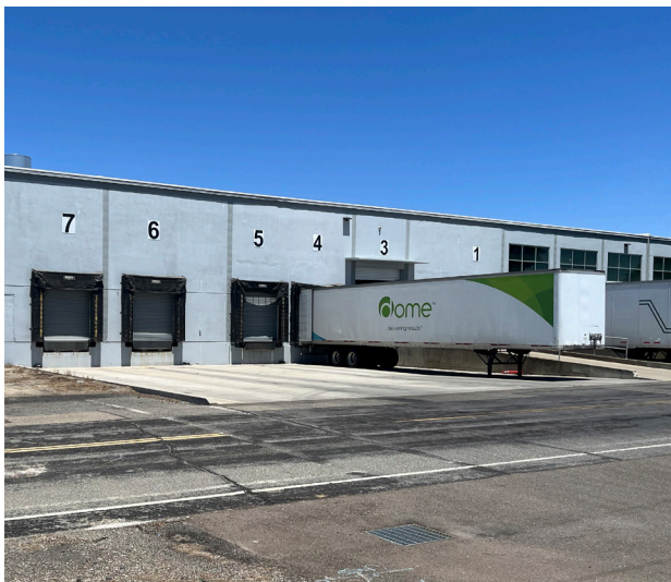
AMPLE DOCK LOADING DOORS