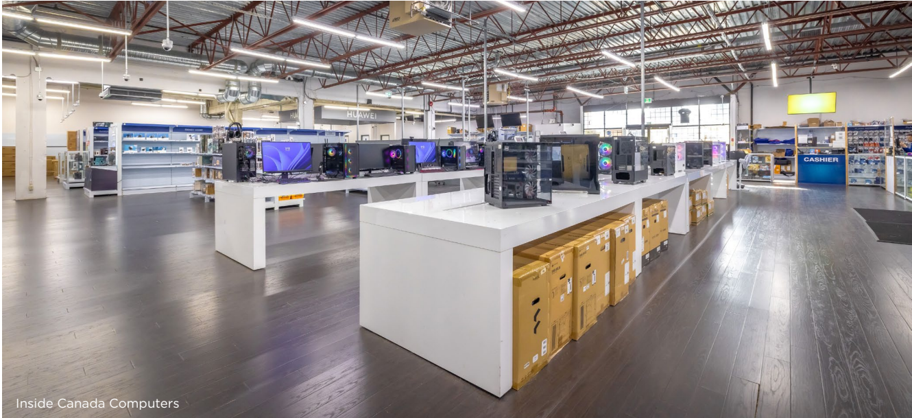
Inside Canada Computers