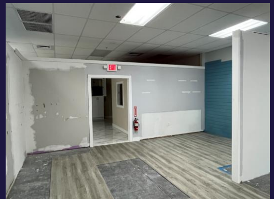
2378 Surfside Blvd Unit A-125, Cape Coral, FL 33991 1,775± SF