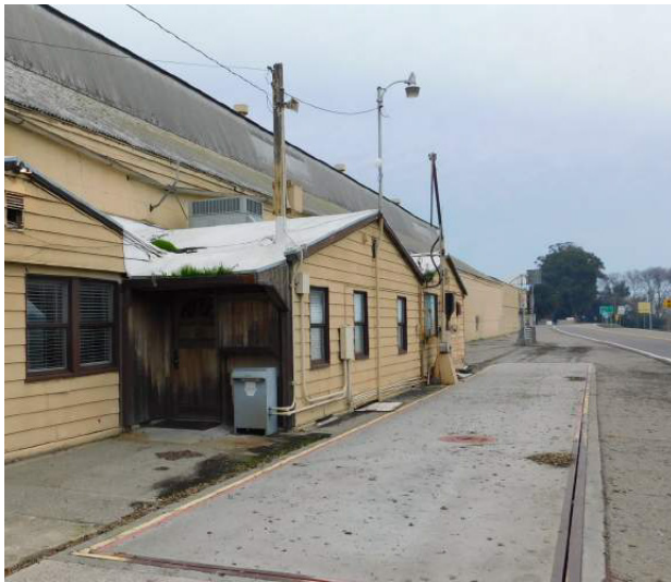
TRUCK WEIGH SCALE