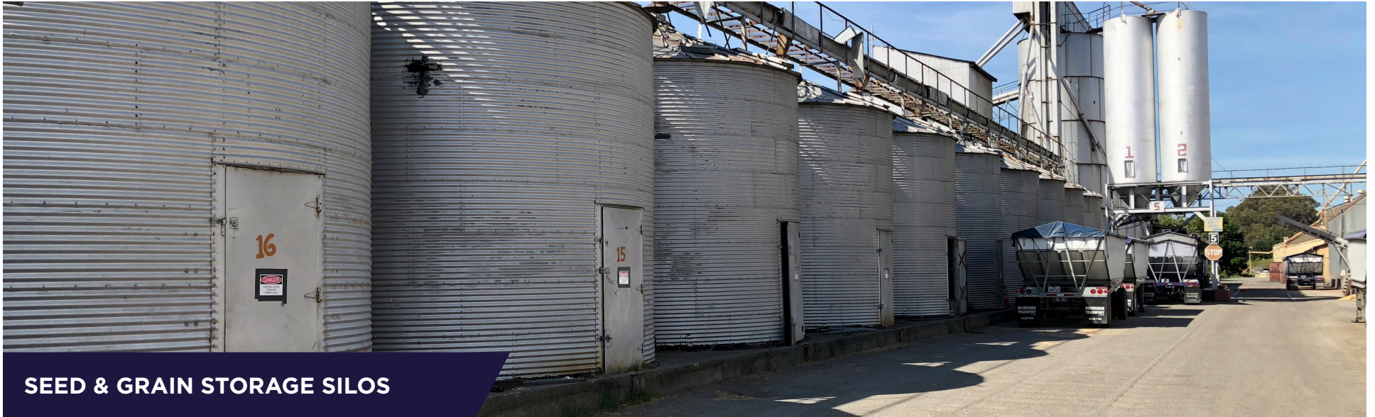
SEED & GRAIN STORAGE SILOS