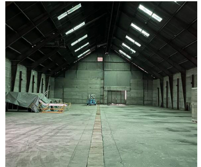
INSIDE SOUTHEAST WAREHOUSE