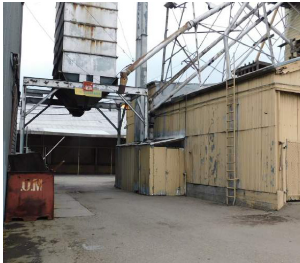
NORTHEAST WAREHOUSE WITH HOPPER