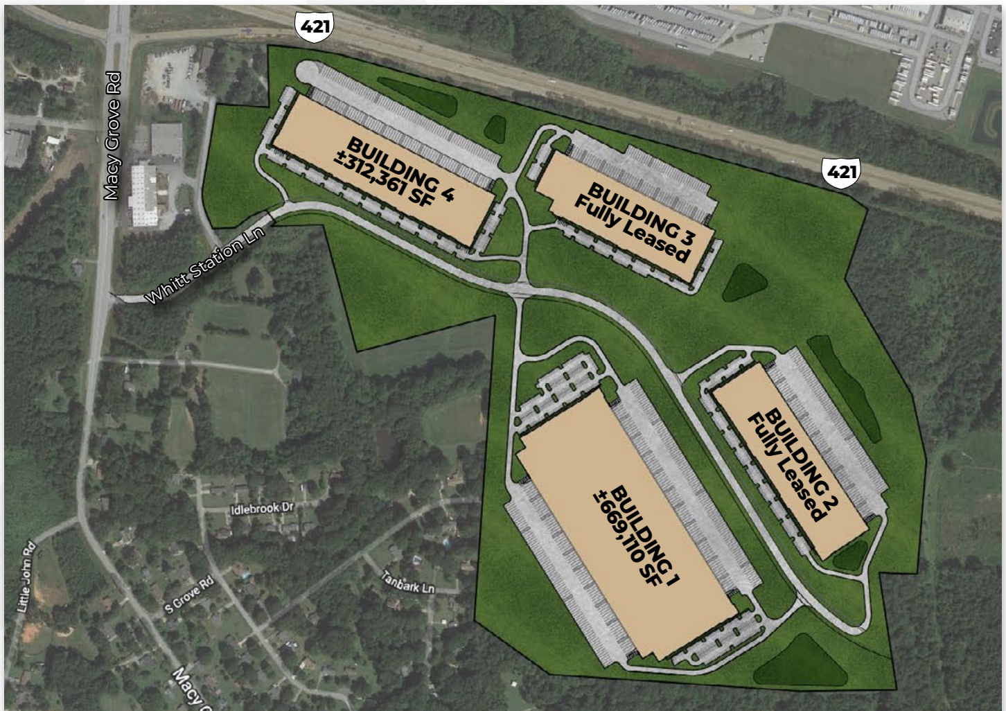
BUILDING 1 1620 Piedmont Commerce Dr