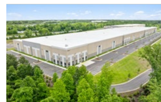
BUILDING 4 1605 Piedmont Commerce Dr