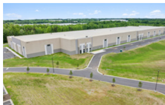
BUILDING 3 1615 Piedmont Commerce Dr