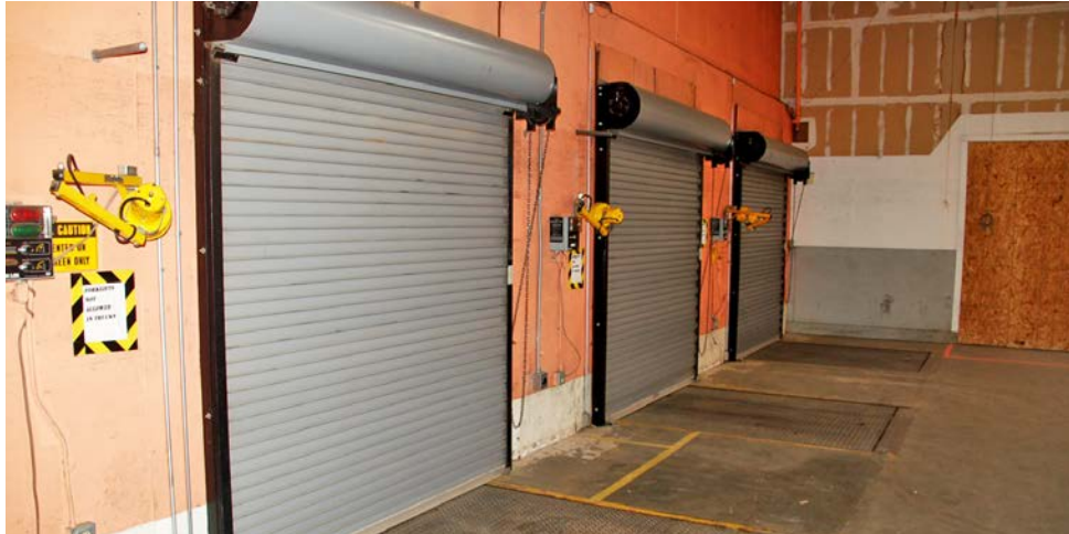
THREE DOCK HIGH ROLL UP DOORS