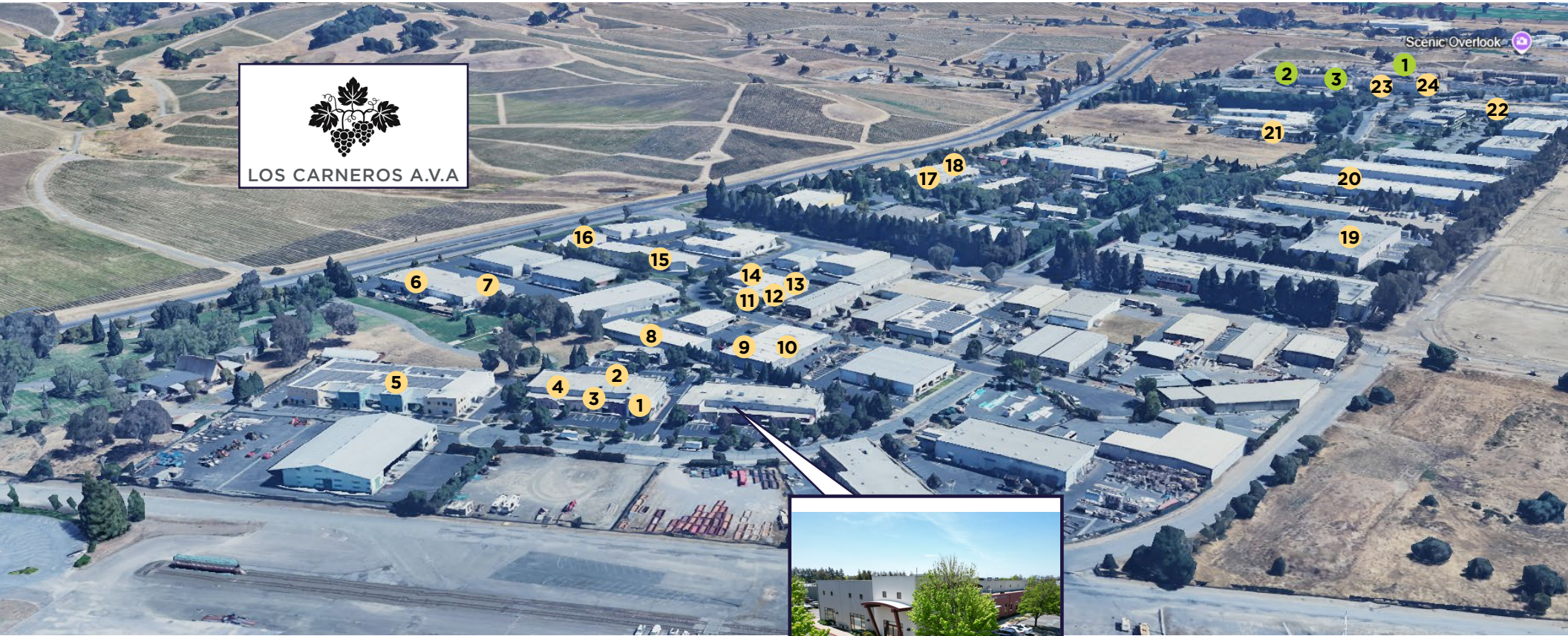
25 ENTERPRISE COURT NAPA CA