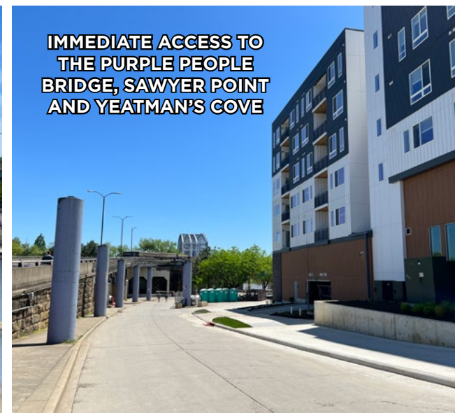
IMMEDIATE ACCESS TO THE PURPLE PEOPLE BRIDGE, SAWYER POINT AND YEATMAN'S COVE