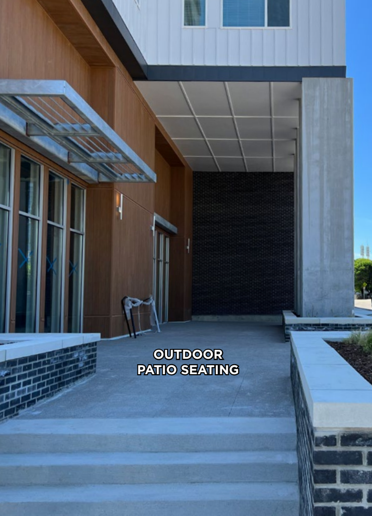
OUTDOOR PATIO SEATING