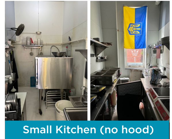
Small Kitchen (no hood)