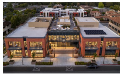
1540 EL CAMINO REAL