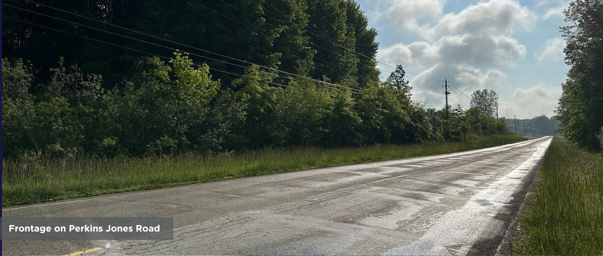
Frontage on Perkins Jones Road