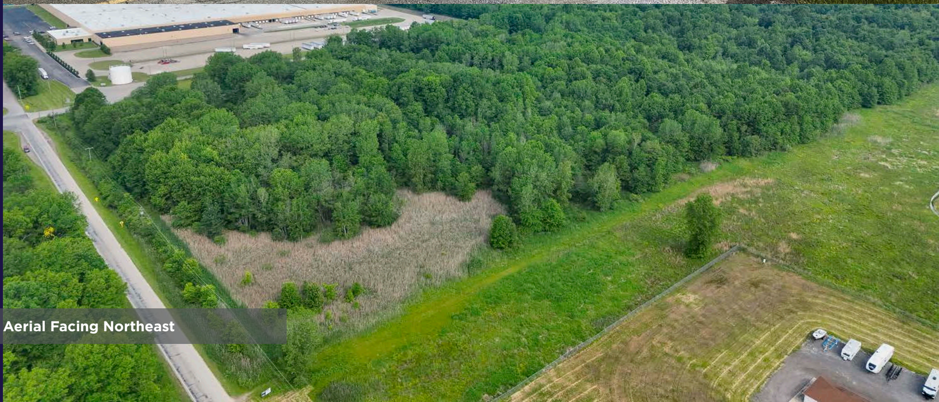
Aerial Facing Northeast