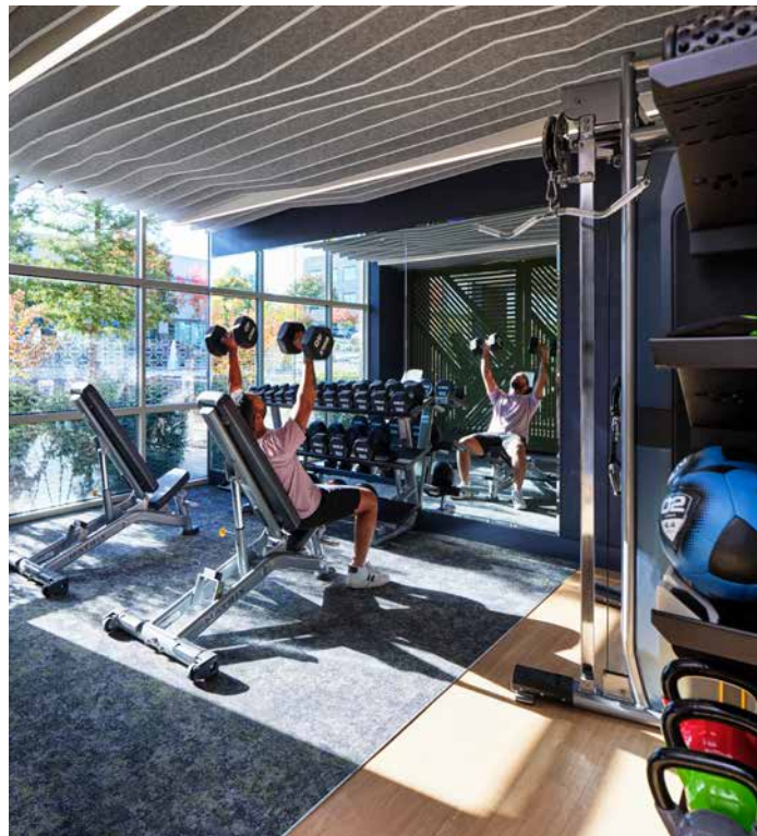
DEDICATED WEIGHTS/STRENGTH AREA