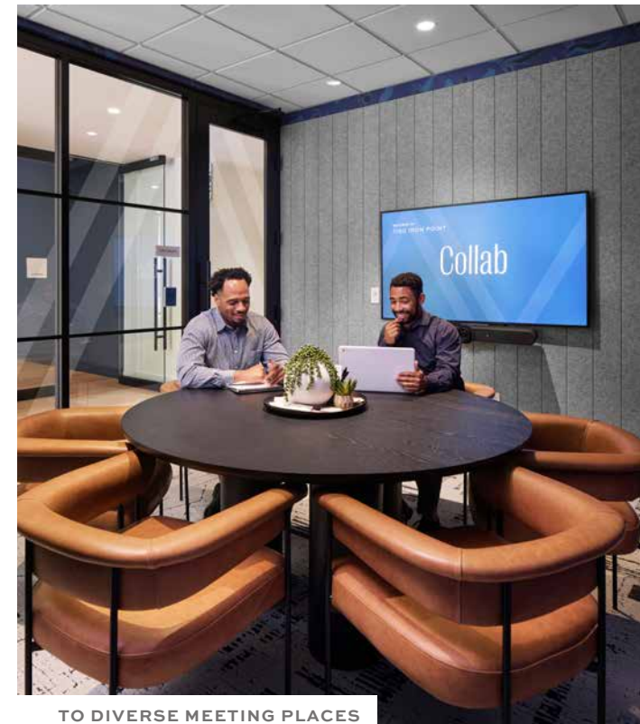
TO DIVERSE MEETING PLACES