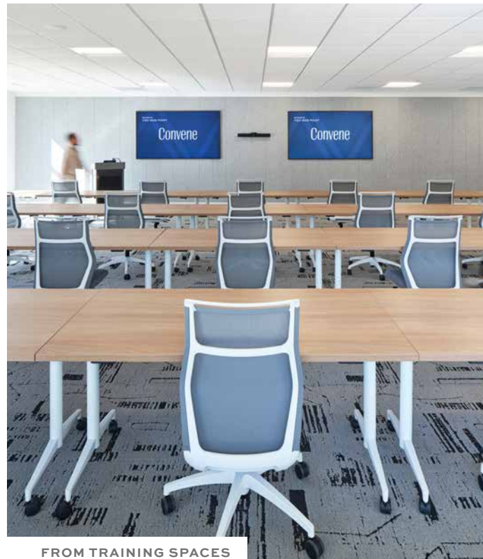
FROM TRAINING SPACES