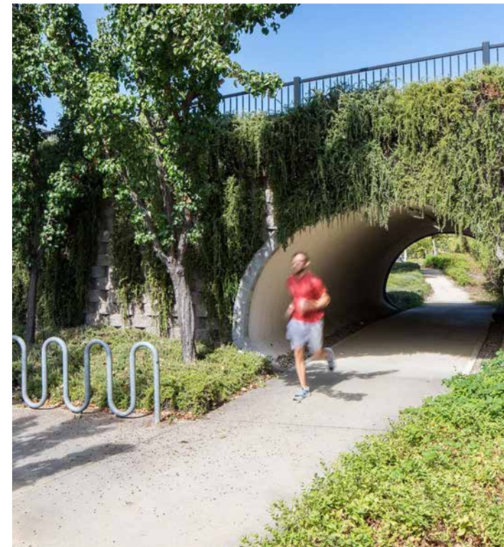
WELL CONNECTED TO TRAILS AND PARKING