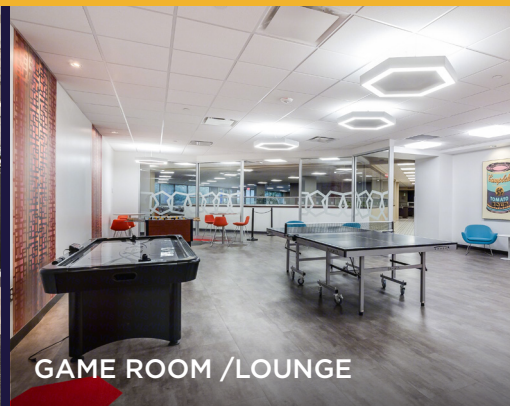
GAME ROOM / LOUNGE