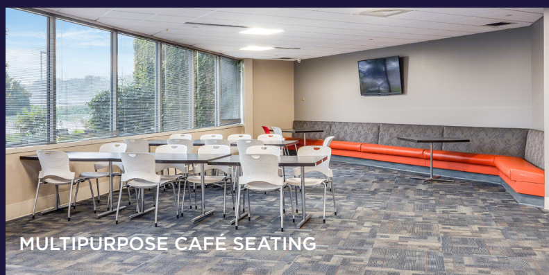
MULTIPURPOSE CAFÉ SEATING