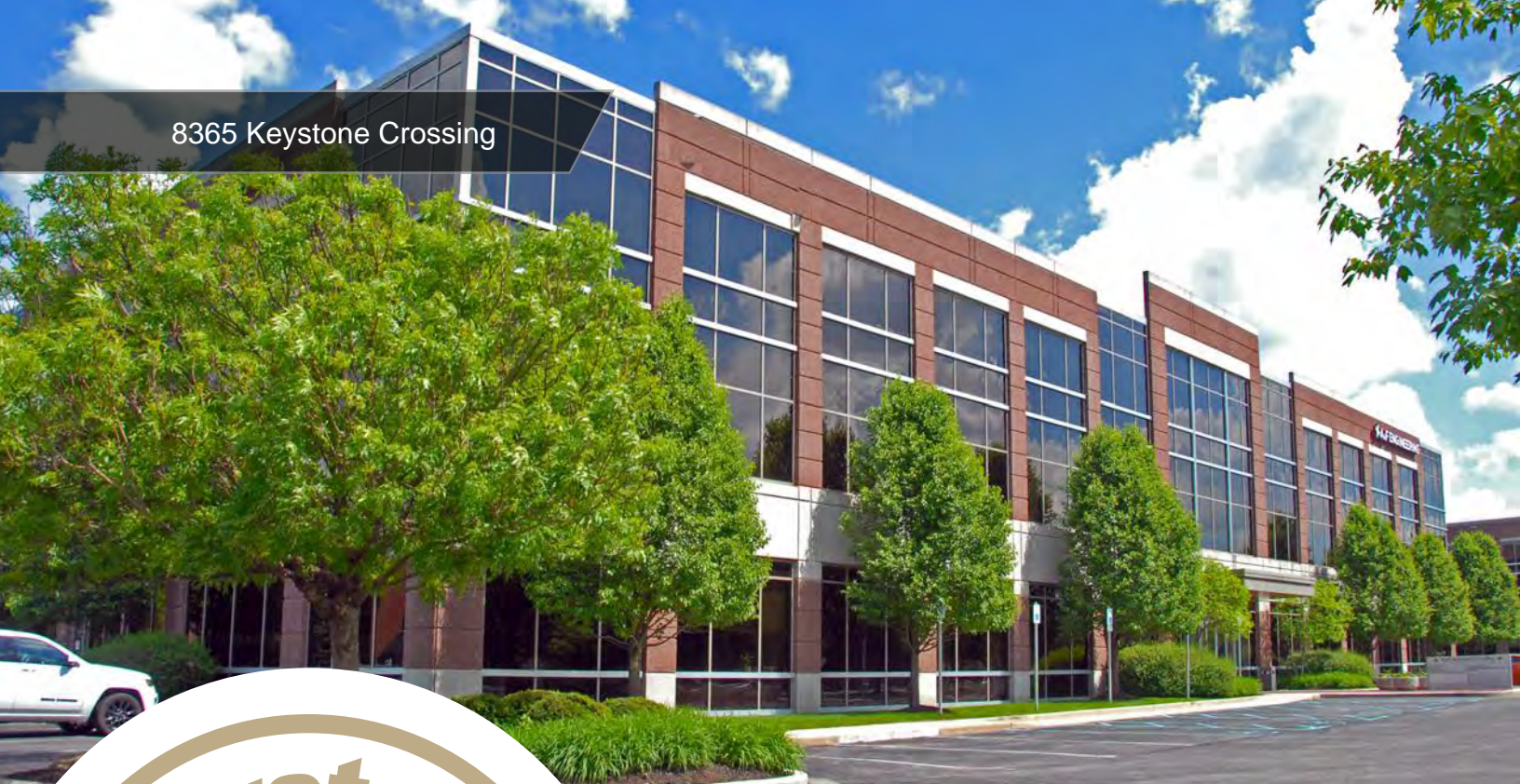
8365 Keystone Crossing