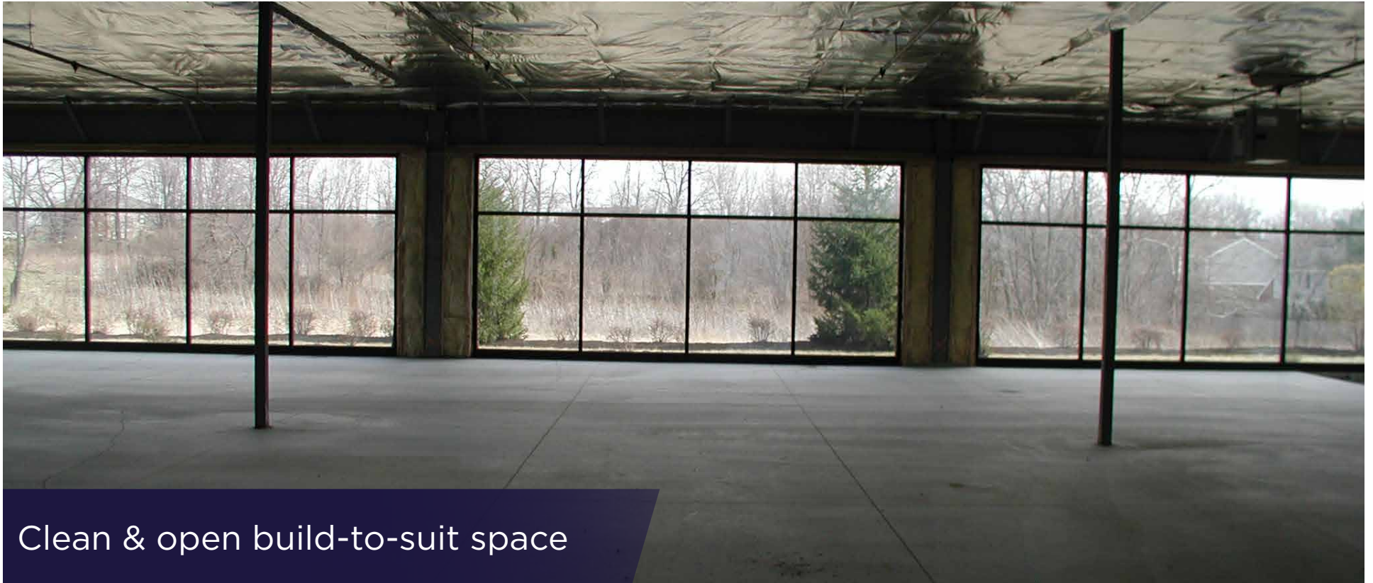
Clean & open build-to-suit space